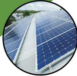
SLANT SOLAR ROOF