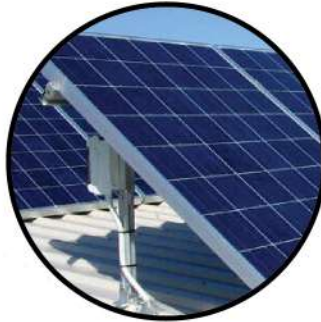
METAL SOLAR ROOF