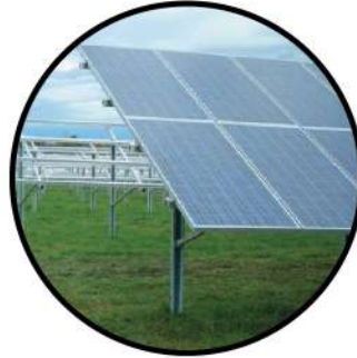
GROUND MOUNTED SOLAR ROOF