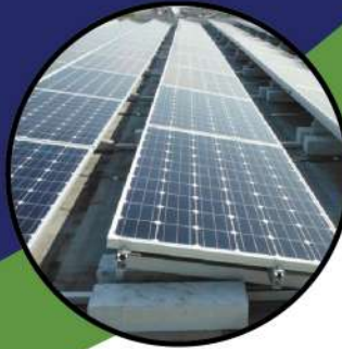
NON PENETRATED STRUCTURE